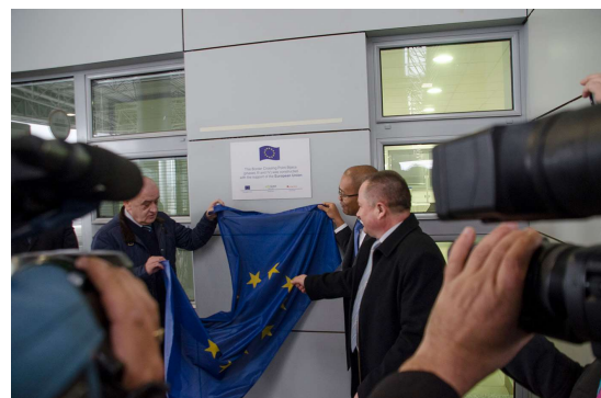
Approximately EUR 40 million has been allocated for construction and improvements of ten border crossings