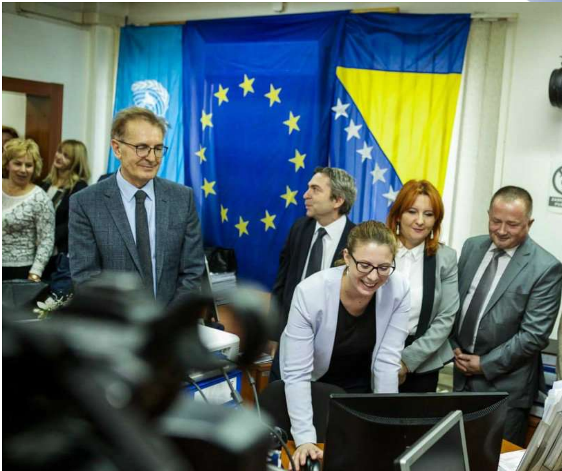
ASYCUDA++, was launched in November 2015 in Bosnia and Herzegovina

DELEGATION OF THE EUROPEAN UNION TO BOSNIA AND HERZEGOVINA