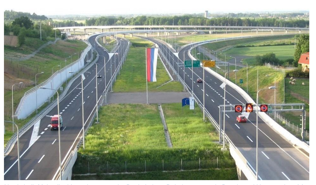
Newly built Mahovljani Interchange on the Banja Luka – Doboj motorway in Bosnia and Herzegovina.