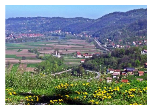
Kostajnica Village in Bosnia and Herzegovina; the Rudanka Interchange will be built in its vicinity.

This investment project concerns the construction of a 6-km motorway on the Svilaj to Doboj section of Corridor Vc, between Interchange Johovac, in Tovira, and Interchange Rudanka in Kostajnica. The proposed development includes the interchanges and a two-lane 1-km long access road in