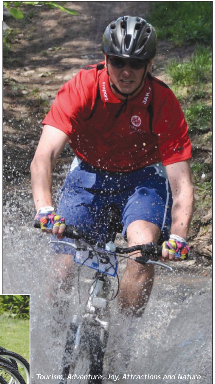
Tourism, Adventure, Joy, Attractions and Nature

Along with training for members of the Mountain Rescue Service and the supply of hiking and other equipment,