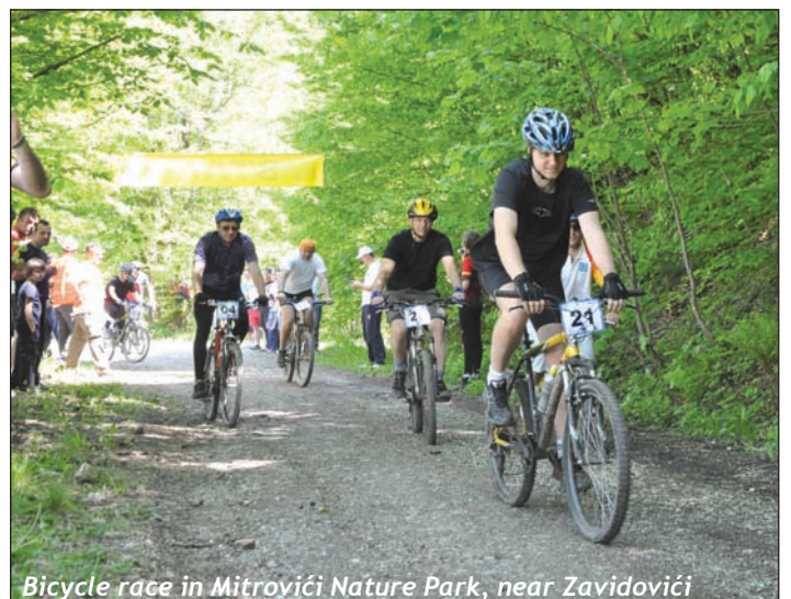
Bicycle race in Mitrovići Nature Park, near Zavidovići