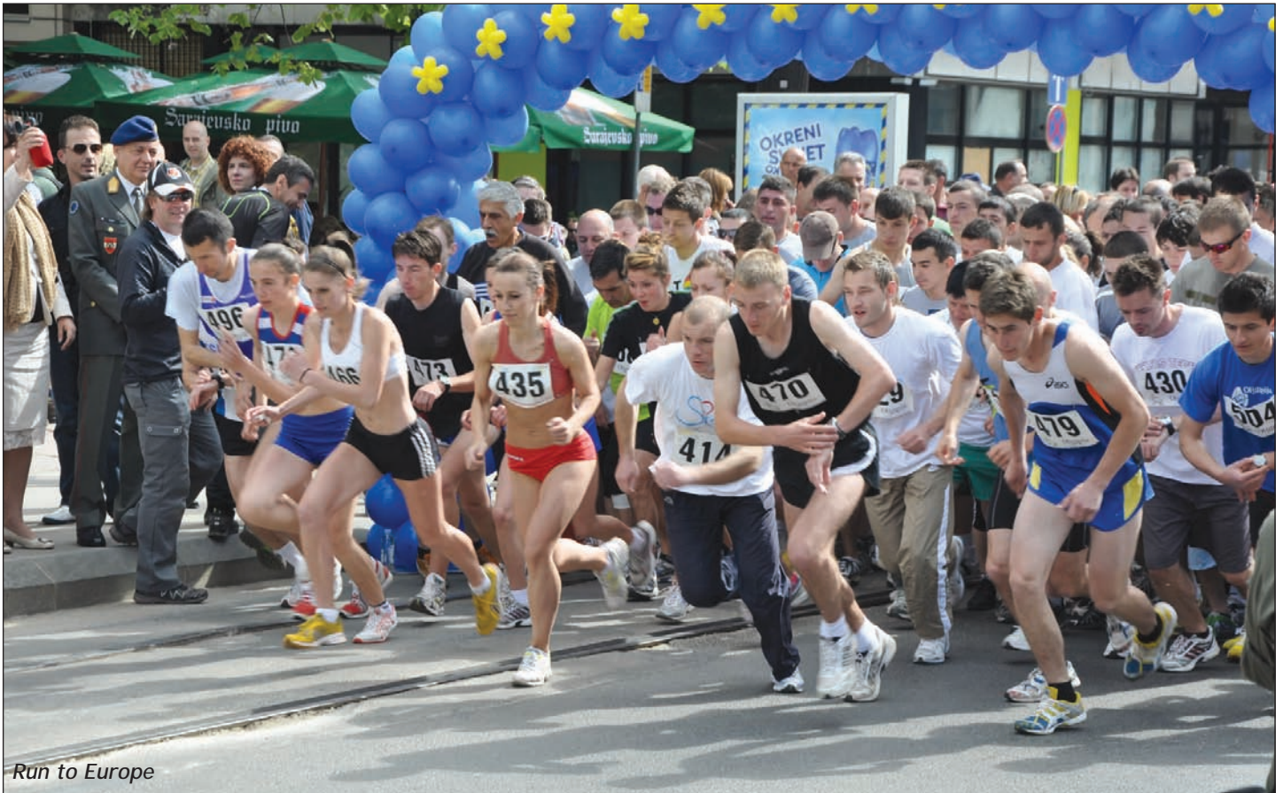
Run to Europe