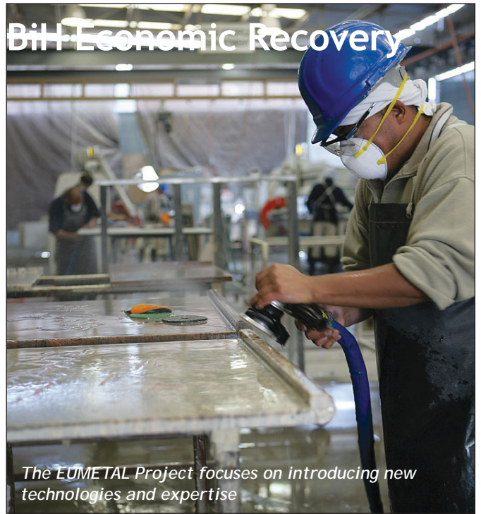
The EUMETAL Project focuses on introducing new technologies and expertise

co-financed for 20 companies. In addition, 200 unemployed people and 100 employees in the metal sector will be trained for occupations that are in short supply, and 50 unemployed people will have an opportunity to work as interns in metal industry companies.