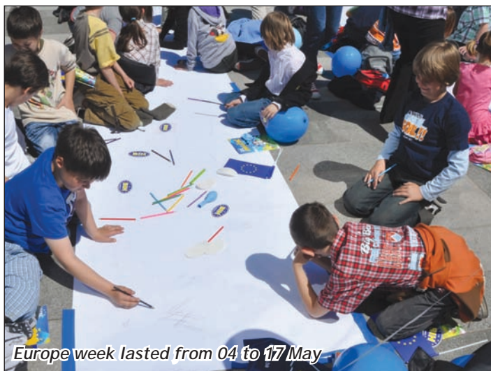
Europe week lasted from 04 to 17 May

and young people participated in quizzes, games, creative workshops, folk dancing and exhibitions which offered an opportunity to learn more about the European Union and Bosnia and Herzegovina’s progress towards European integration. Young people were also given a platform to say what they themselves think of Bosnia and Herzegovina’s prospects for