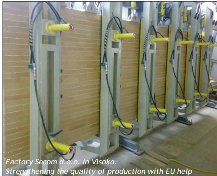
Factory Secom d.o.o. in Visoko: Strengthening the quality of production with EU help

The Business Advisory Services Programme, launched by the EBRD and since 2010 funded by the EU Delegation, helped Secom implement the Quality, Environmental and FSC Chain of Custody Management System (ISO 9001, ISO 14001, FSC CoC) project. The company secured FCS certification in September 2010, and certification audits for ISO 9001 and ISO 14001 were carried out in February