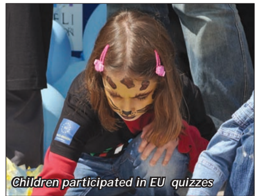
Children participated in EU quizzes