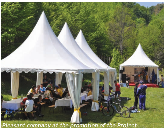
Pleasant company at the promotion of the Project