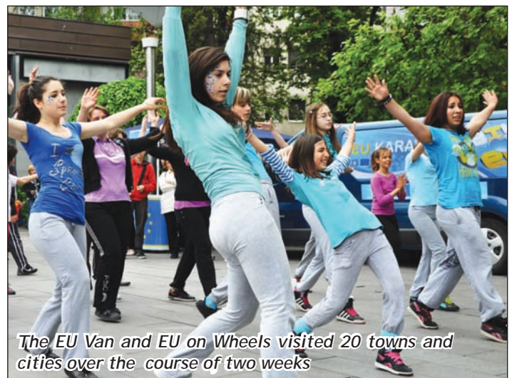
The EU Van and EU on Wheels visited 20 towns and cities over the course of two weeks