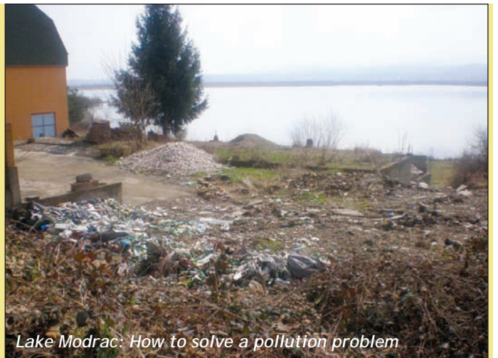
Lake Modrac: How to solve a pollution problem

(CDS) in Tuzla, with financial assistance from the EC Delegation under the European Instrument for Democracy and Human Rights (EIDHR) programme, and has brought together as many as 30 NGOs and