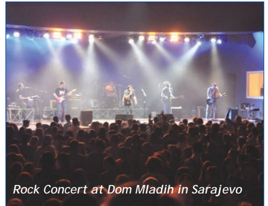
Rock Concert at Dom Mladih in Sarajevo