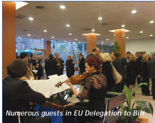
Numerous guests in EU Delegation to BiH