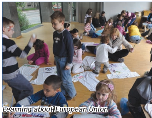
Learning about European Union