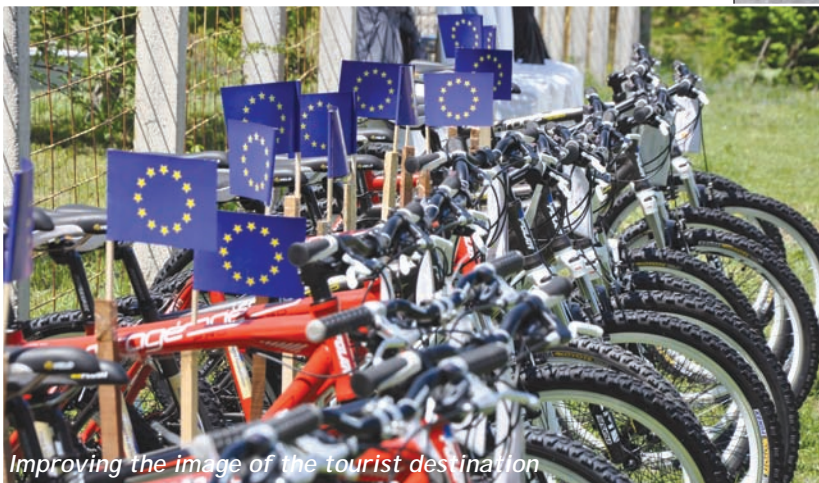
Improving the image of the tourist destination

tourism fairs abroad is planned, together with the organization of sports and other events, and the printing of multilingual promotional materials.