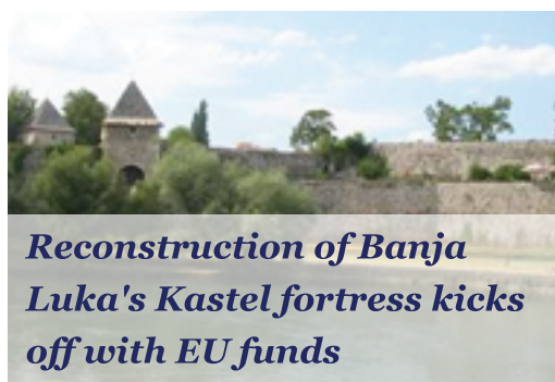
Reconstruction of Banja Luka's Kastel fortress kicks off with EU funds