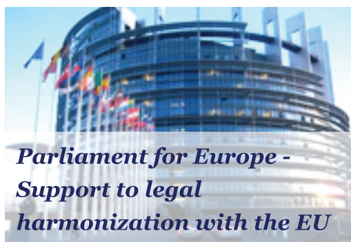
Parliament for Europe - Support to legal harmonization with the EU