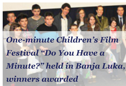
One-minute Children's Film Festival "Do You Have a Minute?" held in Banja Luka, winners awarded