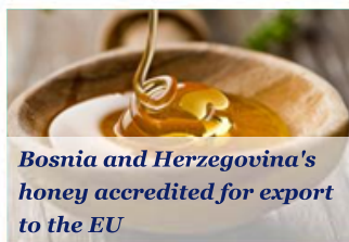
Bosnia and Herzegovina's honey accredited for export to the EU