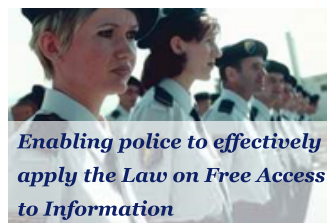
Enabling police to effectively apply the Law on Free Access to Information