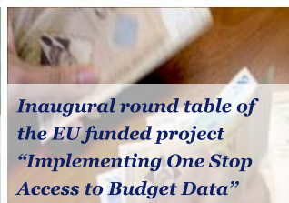
Inaugural round table of the EU funded project "Implementing One Stop Access to Budget Data"