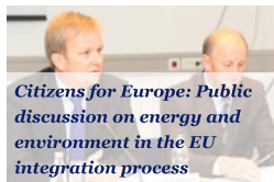
Citizens for Europe: Public discussion on energy and environment in the EU integration process