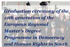
Graduation ceremony of the 12th generation of the European Regional Master's Degree Programme in Democracy and Human Rights in South