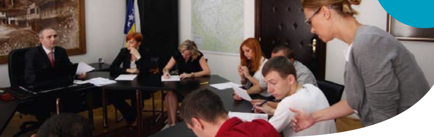
Dialogue between local governments and civil society promotes democracy