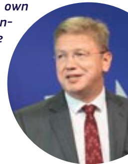
Štefan Füle, Member of the European Commission responsible for enlargement

“The EU’s enlargement policy makes Europe a safer and a more stable place; it allows us to grow stronger, to promote our values and enables us to assume our role as a global player on the world stage. Enlargement policy is not a policy that is being made in isolation just for its own sake, it was from the very beginning – and still is – one of the core functions of the European Union together with the deepening of integration.”