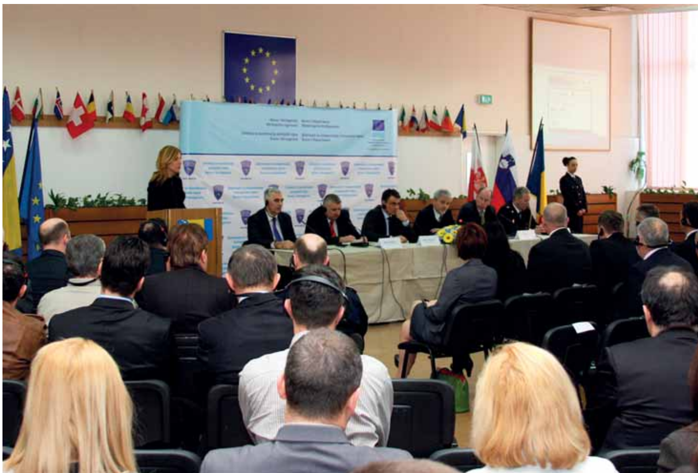
Ceremony to mark launching of project aimed to support BiH Directorate for Coordination of Police Bodies