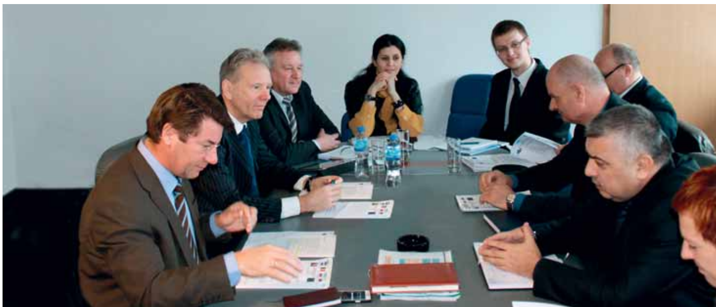
Twinning Project Steering Board Meeting