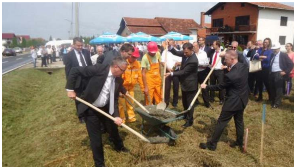
Laying the foundation stone of the Brcko bypass (September 2015). Works are ongoing. The EU has contributed with a €0.5 million project implementation support grant.

In addition, Bosnia and Herzegovina has benefited from regional projects/initiatives funded by the WBIF such as the Regional Energy Efficiency Programme for the Western Balkans (REEP and REEP Plus) and the Western Balkan Enterprise Development and Innovation Facility (EDIF).