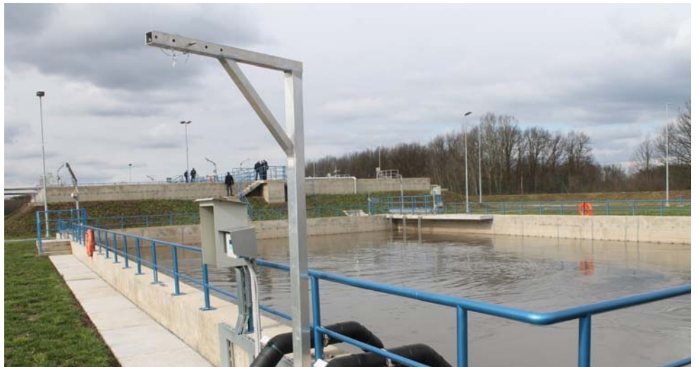
Wastewater treatment plant in Bijeljina. The EU has provided grants in excess of €9 million to cover project preparation and investment works

The EU has thus been instrumental in effecting key improvements in the everyday lives of the citizens in Bosnia and Herzegovina by: