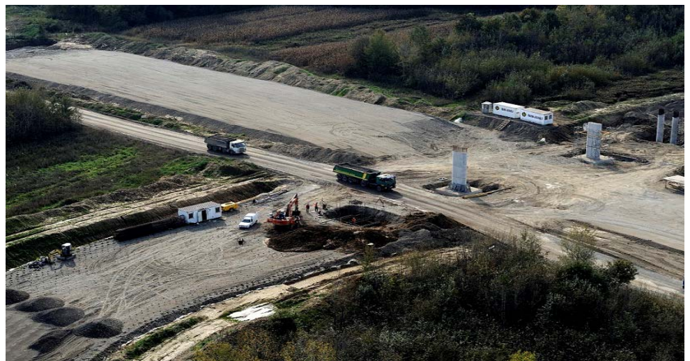
Construction works on the Mediterranean Corridor (CVc) in Bosnia and Herzegovina. The project has benefited from EU grant support in excess of €27 million, including a €25.09 million investment grant under the Connectivity Agenda in 2015.