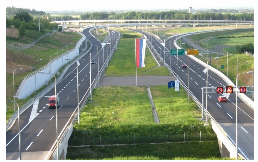
Mahovljanska Interchange on R2, Bosnia and Herzegovina, completed in 2012 with €5.3 million EU and WBIF grant assistance.