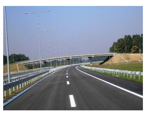
View of Banja Luka – Gradiska motorway, Bosnia and Herzegovina.

The new bridge and cross-border facilities in Gradiška will be built about 3 km to the west of existing facilities and outside the urban area of Gradiška.