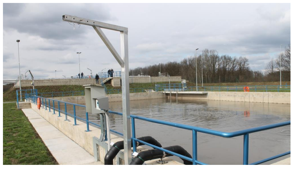
Wastewater treatment plant in Bijeljina. The EU has provided grants in excess of €9 million to cover project preparation and investment works

The EU has thus been instrumental in effecting key improvements in the everyday lives of the citizens in Bosnia and Herzegovina by: