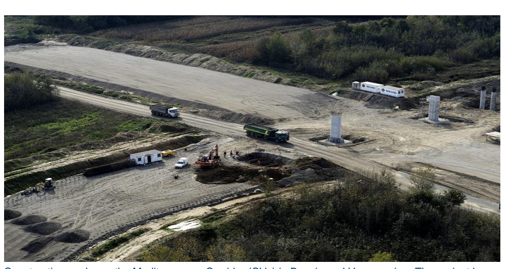
Construction works on the Mediterranean Corridor (CVc) in Bosnia and Herzegovina. The project has benefited from EU grant support in excess of €27 million, including a €25.09 million investment grant under the Connectivity Agenda in 2015.