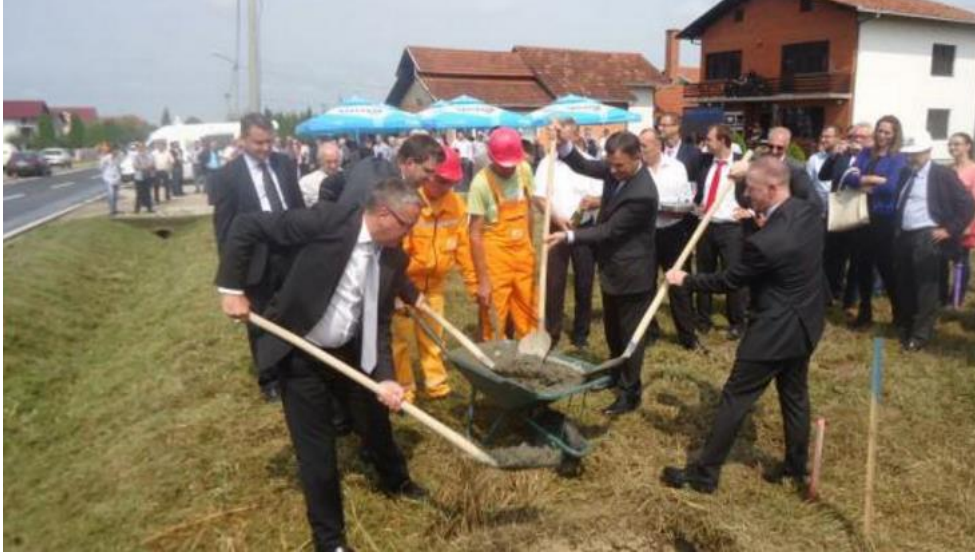
Laying the foundation stone of the Brcko bypass (September 2015). Works are ongoing. The EU has contributed a \leq 0.5 million project implementation support grant.

In addition, Bosnia and Herzegovina has benefited from multi-country initiatives funded by the WBIF, such as the Regional Energy Efficiency Programme for the Western Balkans (REEP and REEP Plus), the Western Balkan Enterprise Development and Innovation Facility (EDIF) and the Regional Housing Programme.