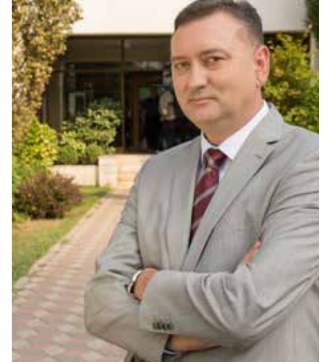
Minister Đorđe Popović Ministry of Transport and Communications of the Republika Srpska

'The construction works on all sections of Corridor Vc continue at full scale without significant difficulties, with due regard to the safety measures put in place to prevent the spread of the coronavirus. We work closely with all the contractors on implementing the actions that must be followed at construction sites to reduce the risk of jeopardizing the progress of the works.'