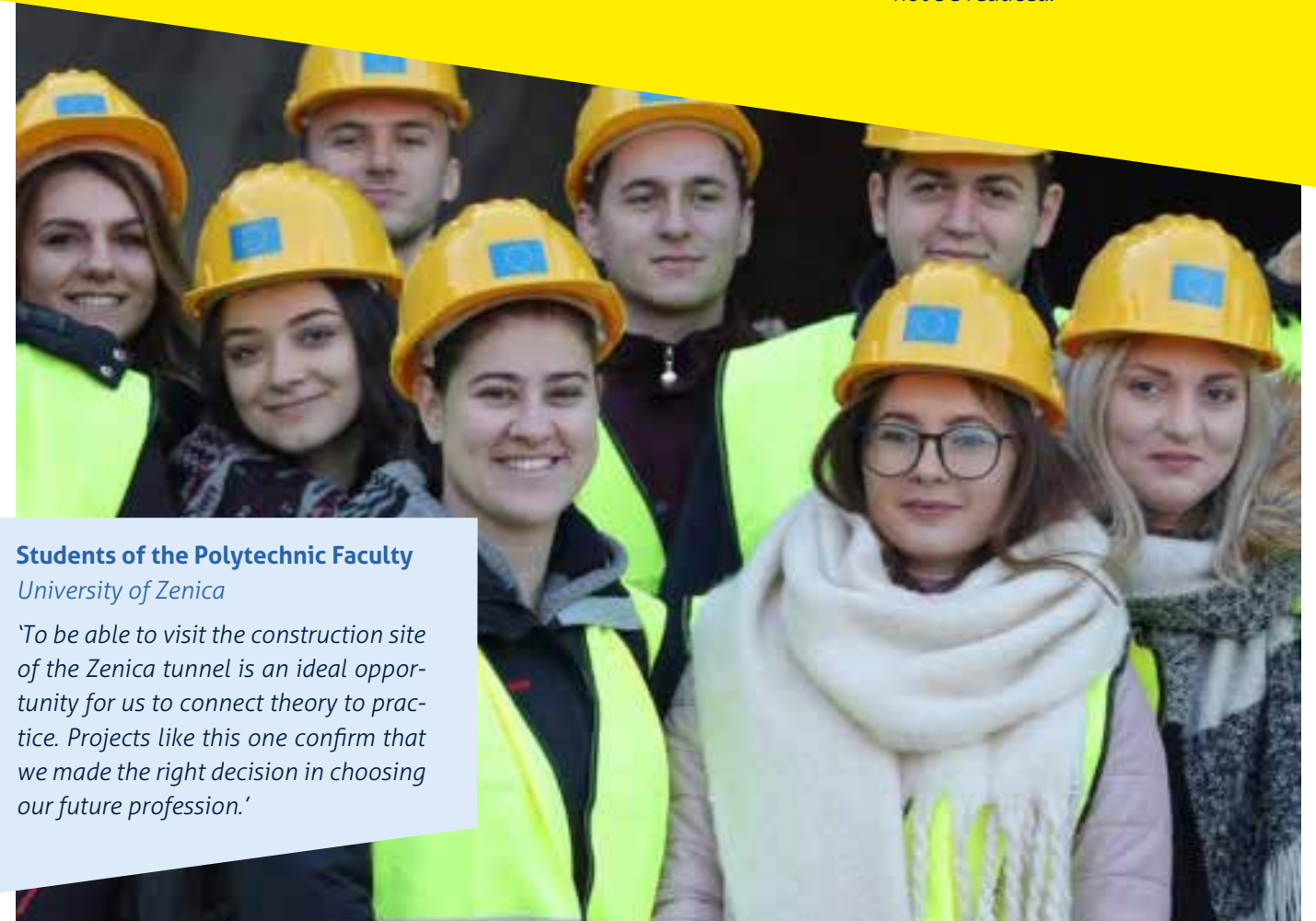
Students of the Polytechnic Faculty University of Zenica

'The Government of Republika Srpska, despite the current crisis caused by the coronavirus, which will have significant consequences on the economy and budget, does not give up its strategic projects, the planned dynamics and timeline of their implementation. We hope that for all these projects, as before, we will have the support of the European Union, and the planned grant funds for transport projects will not be reduced.'